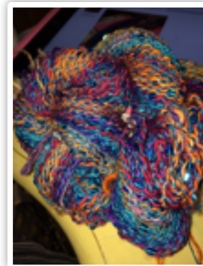
Merino/silk HANDspun yarn plied with sequins