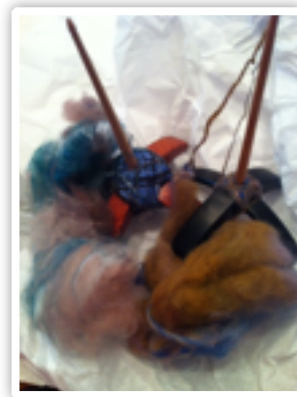
Turkish drop spindles and carded batts of alpaca silk

The classes will build each week from learning how to make the wheel or spindle work to plying and finishing techniques.